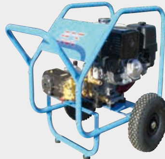
Thermal High Pressure cleaner 270 bar