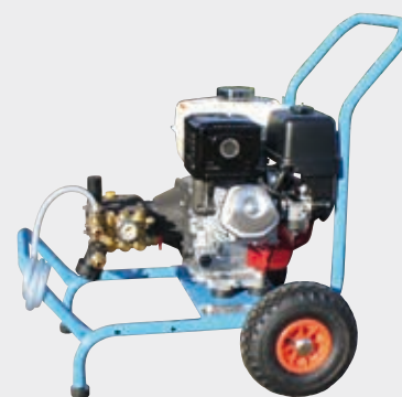
Thermal High Pressure cleaner 200 bar