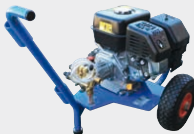
Thermal High Pressure cleaner 190 bar