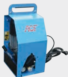
Electric High Pressure cleaner 150 bar