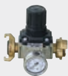
Air pressure regulator P 100