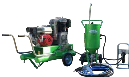
KIT TOPOLINO 18