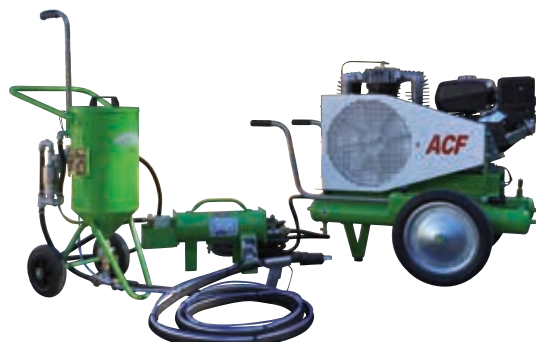
MAXI TOPOLINO 18