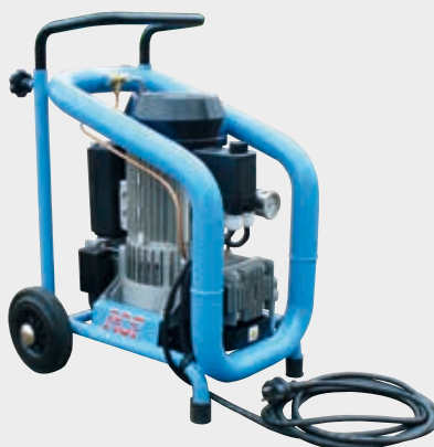
Air compressor 200 l/mn N 001