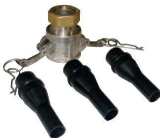
Pointing kit 1 adapter + 3 pointing nozzles Ø 10, Ø 12 and Ø 14