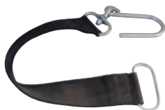
Hose carrying strap P 603