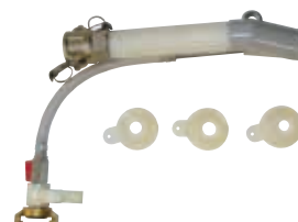
Spraying kit 1 spraying hose + 3 spraying nozzles Ø 8, Ø 12 and Ø 16