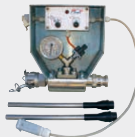
"Special injection" kit P 731