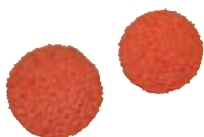
Cleaning foam balls 2 cleaning balls P 602