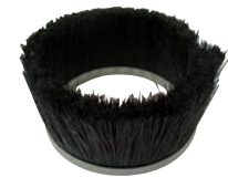
Straight brush S 859

Ø 3 mm (or 4 mm under 4 bar) nozzles can be used considering the suction power of the vacuum cleaner. Abrasive materials depend on the surface to be cleaned. Recycling is possible depending on the support and the kind of media. Boron carbide nozzles are recommended for corundum.