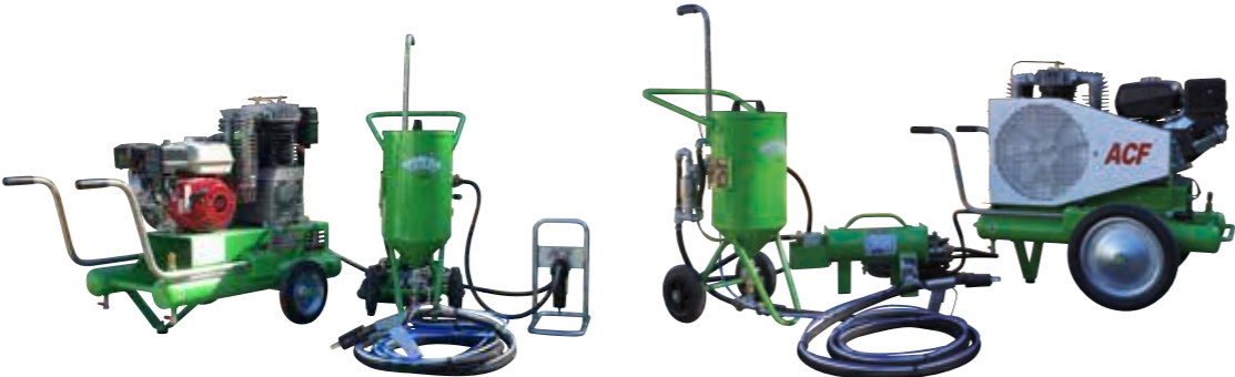
KIT TOPOLINO 18

TOPOLINO 18 + air compressor + moisture separator + hoses